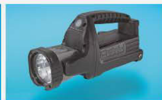
Portable lamp 6148

Dimensions 50 x 112 x 112 mm Rechargeable battery 8 h