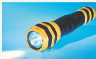
Hand lamp 6140

Dimensions 222 x 59 mm Rechargeable battery 48 h