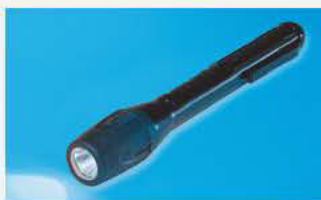
Hand lamp 6141/61

Zone 1 - II 2G Ex ib IIC T4 Gb Zone 21 - II 2D Ex ib IIIC T81°C Db IP68