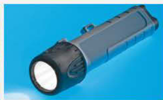
Hand lamp 6141/62

Zone 0 - II 1G Ex ia op is IIC T4 Zone 20 - II 1D iaD 20 T130°C